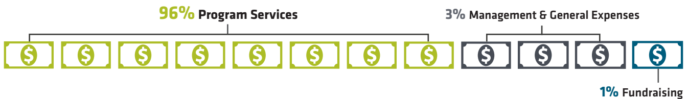
Percentage of Total Expenses