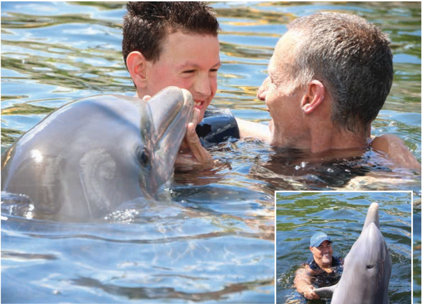
The Trust granted funds to Island Dolphin Care Inc. in Florida to allow ill and injured veterans to receive therapeutic and educational dolphin-assisted services.