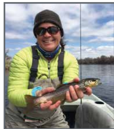
Project Healing Waters Fly Fishing Inc. conducts therapeutic fly-fishing programs and outings for disabled veterans in Maryland.