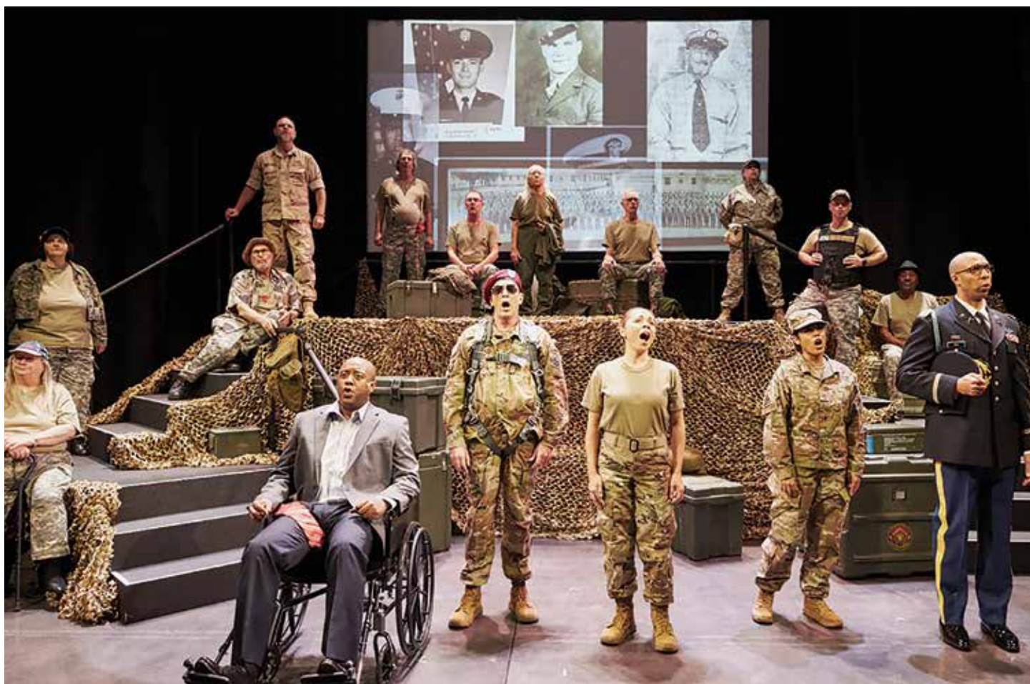
The chorus of “The Falling & the Rising” at Seattle Opera was composed of local veterans who have experienced homelessness and other trauma. In 2019, the opera presented five performances of the production, which was attended by over 1,100 individuals—84% of whom were veterans or family members of veterans.