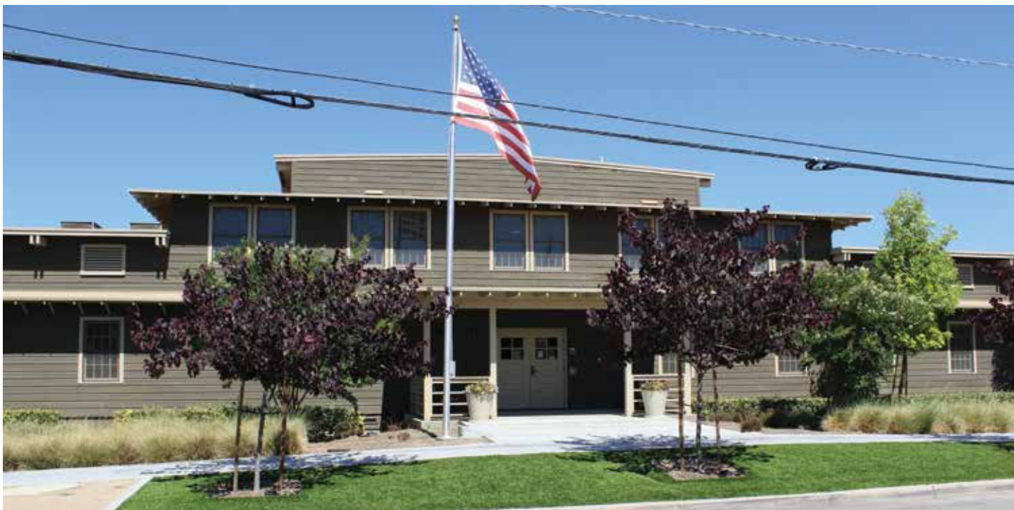
Mercy House Living Centers provides residential services to veterans in California.