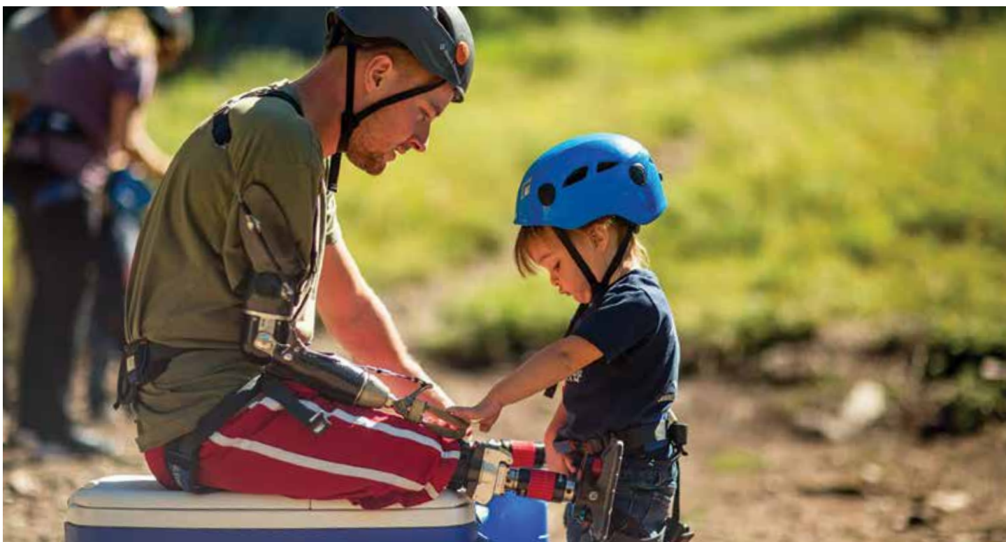
Disabled veterans can take part in the Vail Veterans Foundation Inc. Summer Family Program, which is supported by the Trust.