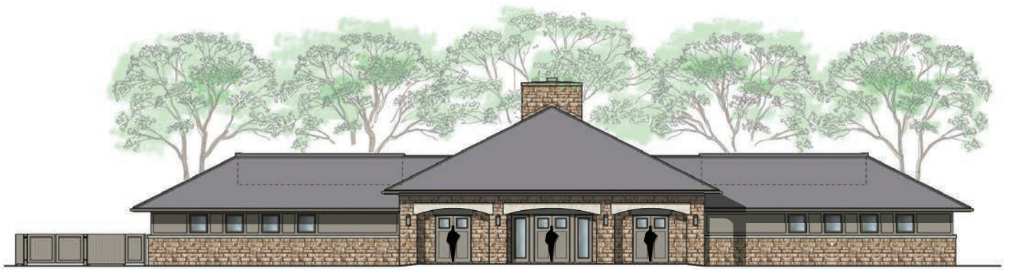
National Center of Excellence for Complex Post Traumatic Stress.

Save A Warrior provides an alternative, warrior-led, holistic service that equips veterans, military personnel, police, firefighters and other first responders with a community of support and effective techniques to overcome the symptoms associated with post-traumatic stress and suicidal ideations.