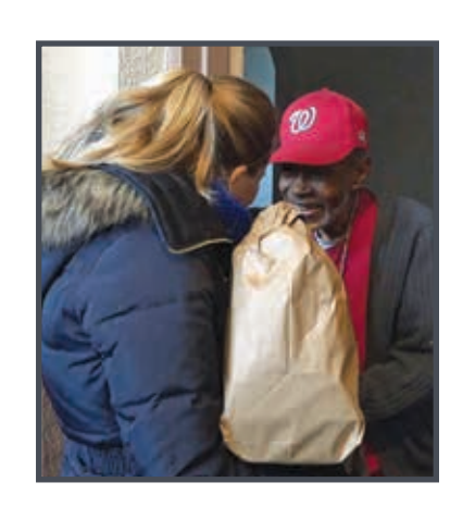
With help from the DAV Charitable Service Trust, Food & Friends helps address food insecurity for veterans near the nation's capital.