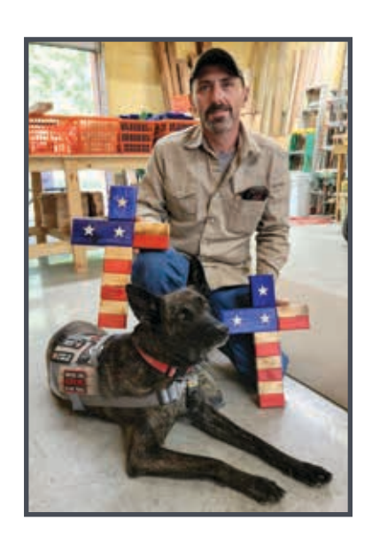
At Operation Honor Corps, each Patriot Cross is handcrafted with honor and respect by veteran craftsmen.