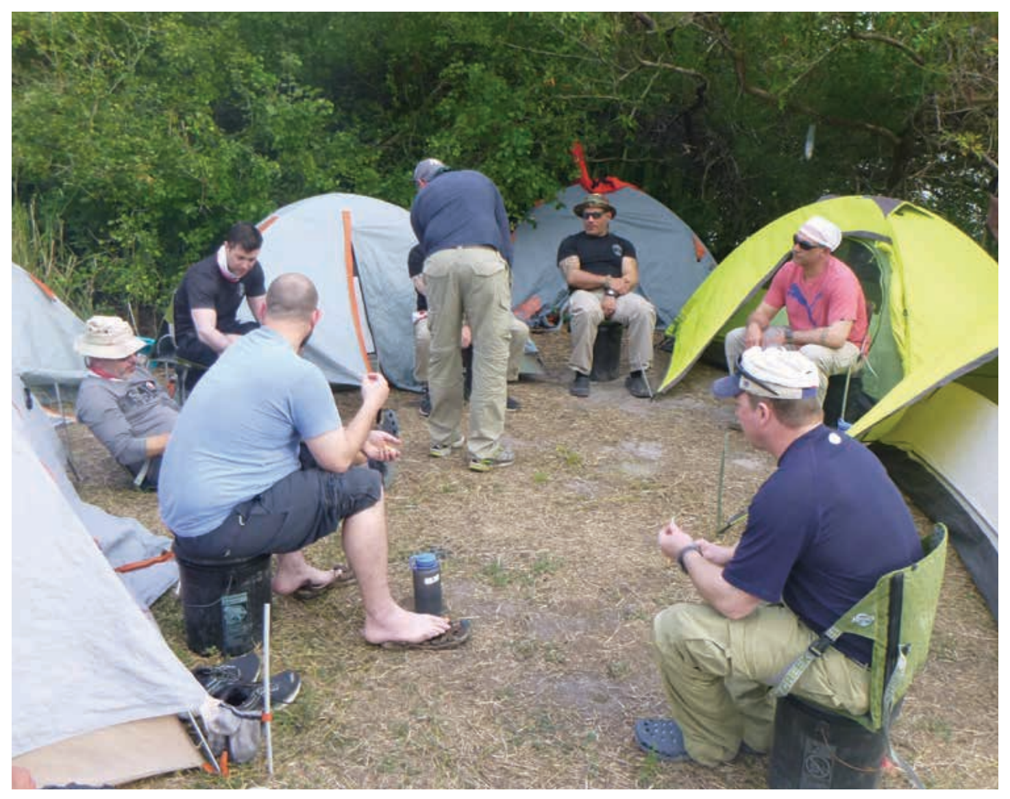
Outdoor recreational therapy-like that offered by Outward Bound-has proven to be an effective healing tool for injured and ill veterans.