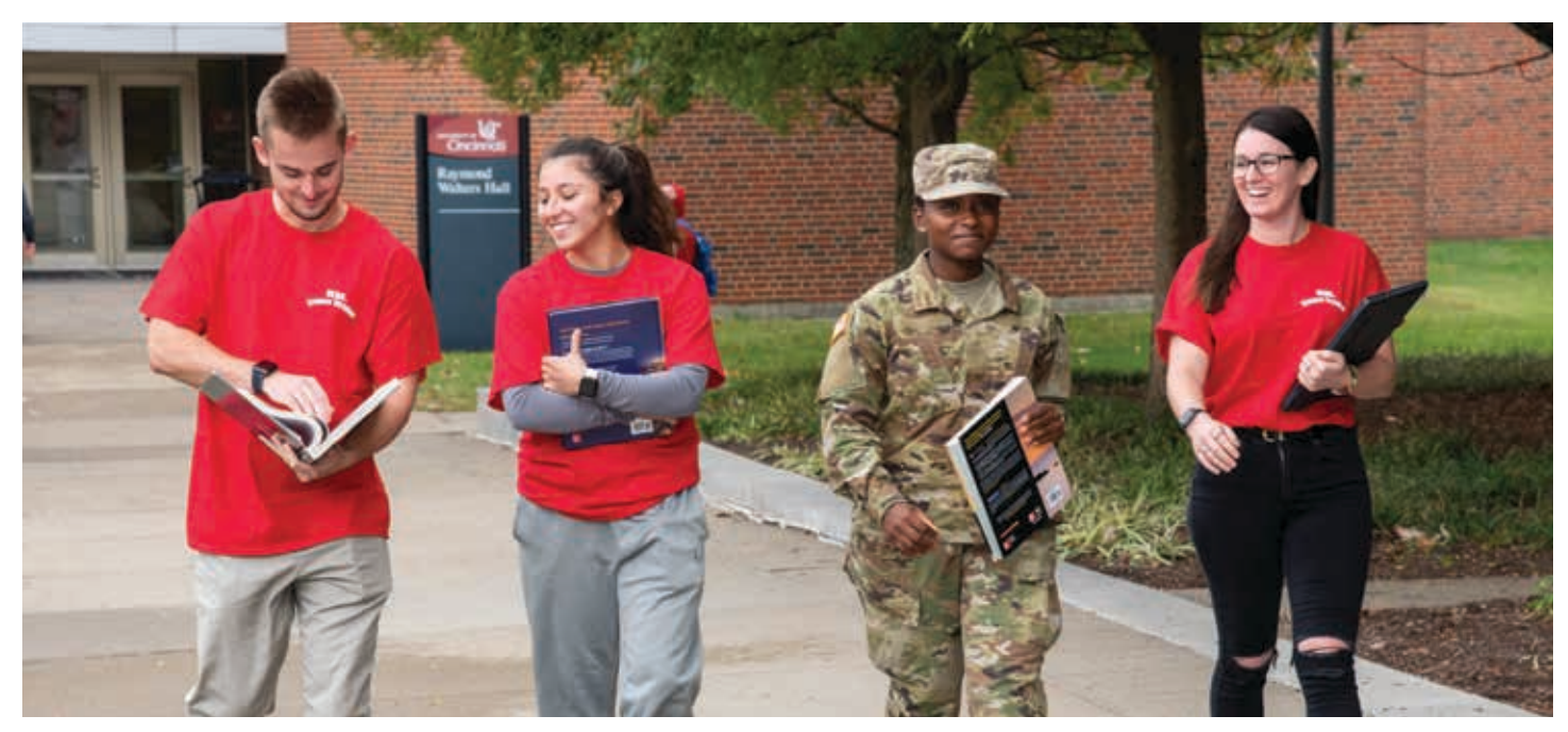
With the Trust's support, the University of Cincinnati Foundation is helps student veterans fund their education.