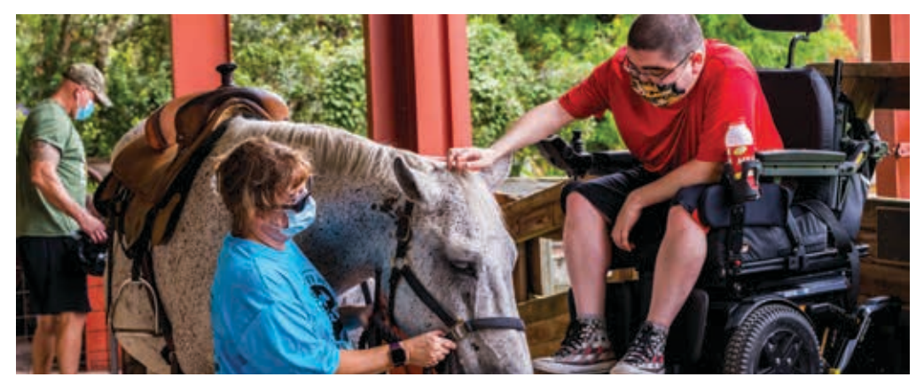
Therapeutic riding is an excellent form of exercise therapy that is fun, safe, challenging and socially rewarding. Lesson plans at Quantum Leap Farm are tailored individually to address veterans' and their families' needs.