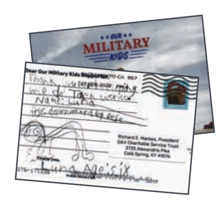
A scholarship recipient from Our Military Kids offers an expression of gratitude for the taekwondo lessons she received.