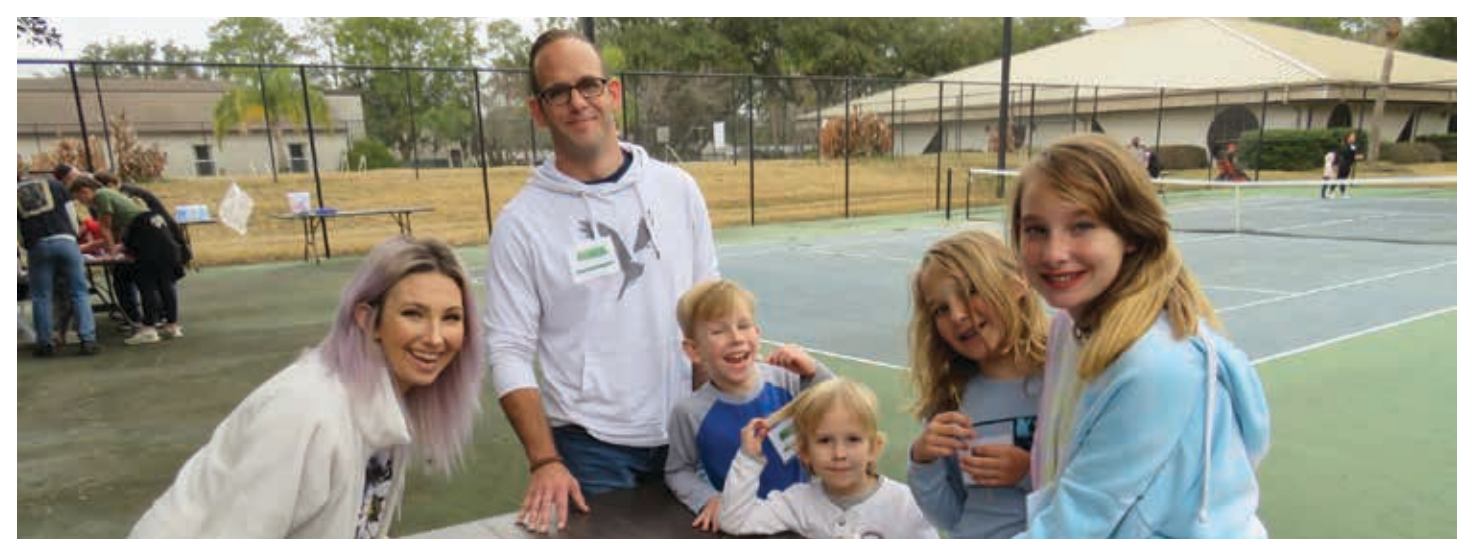
Through A Sanctuary for Military Families Inc., families attend six-day therapeutic retreats at locations like Epworth by the Sea in St. Simons, Georgia. There, they participate in activities designed to reenforce the skills learned in carefully crafted workshops focusing on relationships, family matters, financial health and post traumatic growth.